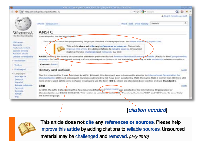
Figure 1: The Wikipedia article "ANSI C" with two cleanup tags. The tag box Unreferenced refers to the whole articles and the inline tag Citation needed refers to a particular claim.

Cleanup tags are a means to tag flaws in Wikipedia. As shown in Figure 1, they are used to inform readers and editors of specific problems with articles, sections, or certain text fragments. However, there is no single strategy to spot the entire set of all cleanup tags. Cleanup tags are realized based on templates, which are special Wikipedia pages that can be included into other pages. Although templates can be separated from other pages by their namespace (the prefix "Template:" in the page title), there is no dedicated qualifier to separate templates that are used to implement cleanup tags from other templates. A complete manual inspection is infeasible as Wikipedia contains nearly 320 000 different templates. We hence introduce an automatic extraction approach that exploits several sources within Wikipedia containing meta information about cleanup tags (Section 3.2). The extracted cleanup tags give us the set of quality flaws that have been identified and tagged by Wikipedia users. We organize the flaws along a small set of general flaw types, to breakdown the quality flaw situation within Wikipedia (Section 3.3). At first, we describe the data underlying our analyses (Section 3.1).